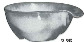
*4X—14 OZ. CEREAL 3.25