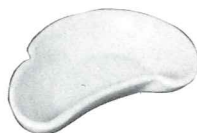
*243—6½" CRESCENT SALAD 2.50