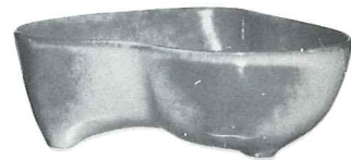
*4N—24 OZ. VEGETABLE 4.75