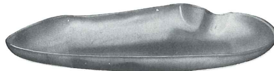
*4P—13" PLATTER 7.75