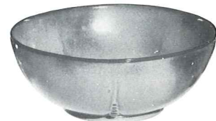
*224—8" ROUND BOWL 6.50