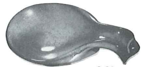
*4Y—6" SPOON HOLDER 3.00