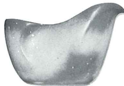
4A—8 OZ. CREAMER 3.25