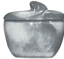
4B—SUGAR WITH LID 5.00