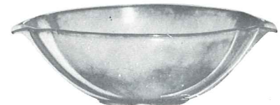
*201—9" BOWL 4.75