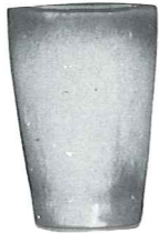
*5L—12 OZ. TUMBLER 3.75