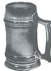
*M2—18 OZ. STEIN 4.50