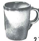
*5CC—5 OZ. TEACUP 2.75